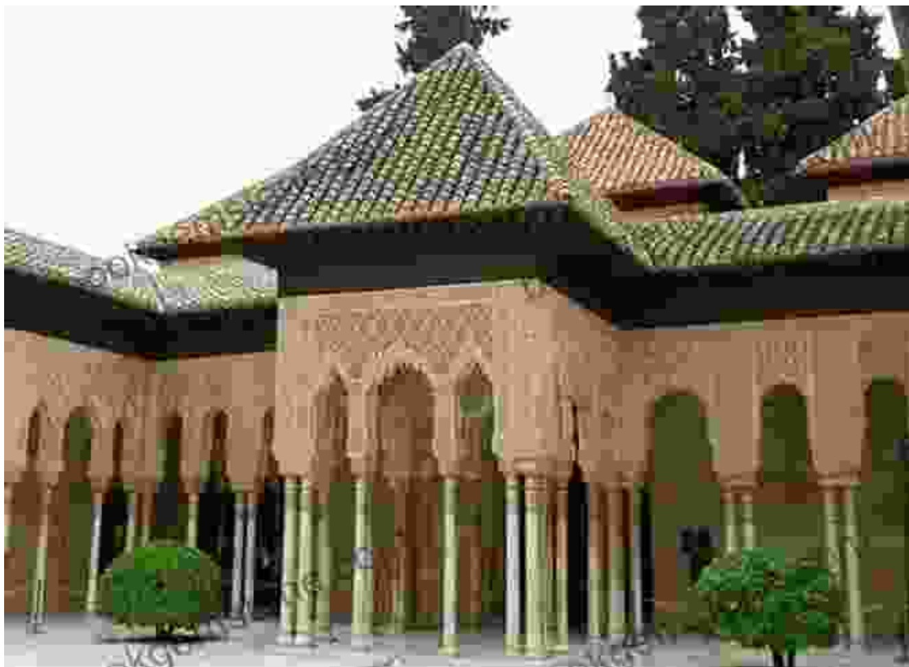
The Alhambra Palace, a UNESCO World Heritage site

Nestled in the foothills of the Sierra Nevada mountains, Granada captivates visitors with its breathtaking Alhambra Palace. This UNESCO World Heritage site is a masterpiece of Moorish architecture, a testament to the city's glorious past as the last stronghold of the Nasrid dynasty.