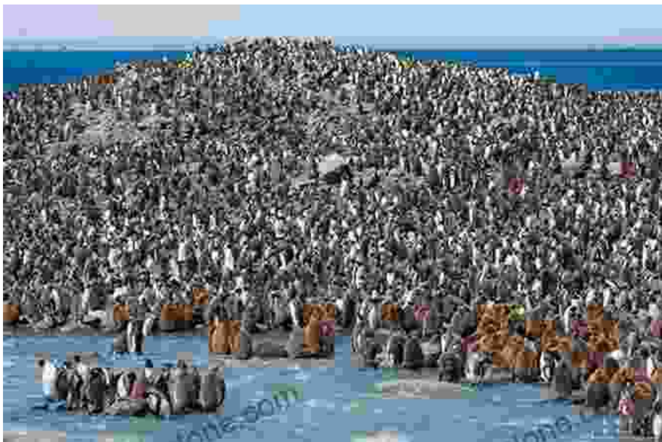
A colony of king penguins at St. Andrews Bay in South Georgia

South Georgia is known for its stunning scenery, and the landscape is a mix of mountains, glaciers, and icebergs. The islands are also home to a variety of wildlife, including penguins, seals, and whales. One of the most popular tourist attractions in South Georgia is the colony of king penguins at St. Andrews Bay.